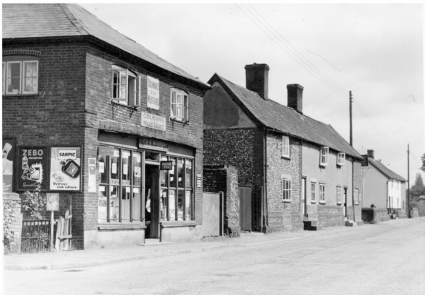
Hepworth Street - mid 50's

Hepworth Charities Information see inside front cover